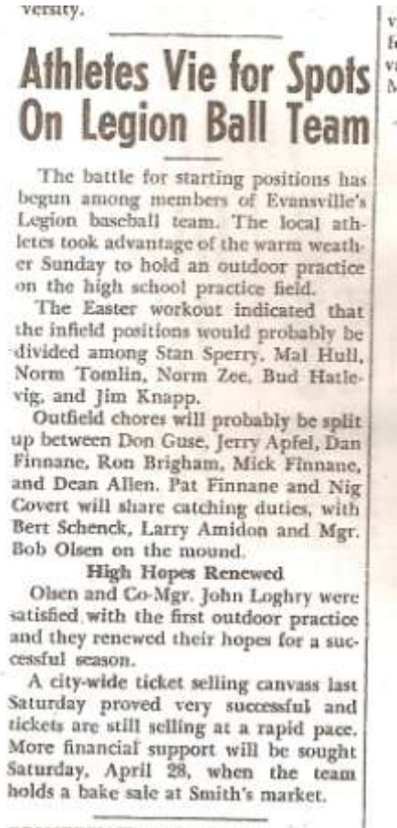
April 5, 1956, Evansville Review, p. 1, col. 1, Evansville, Wisconsin